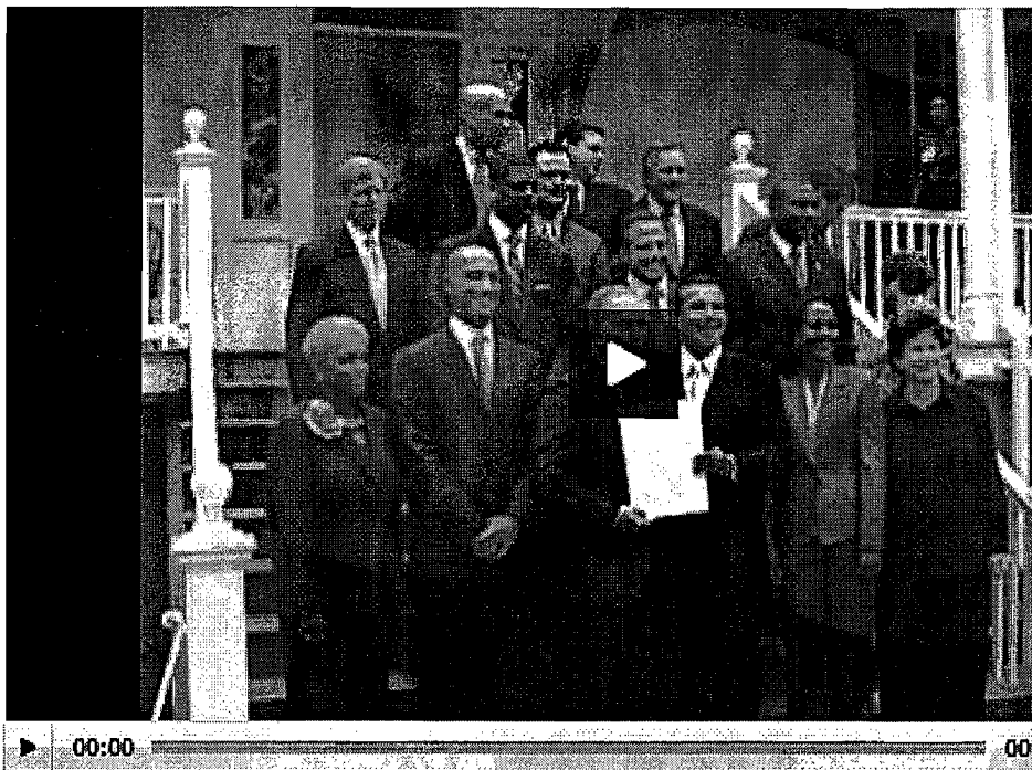
Watch founding mayors talk about the importance of volunteerism